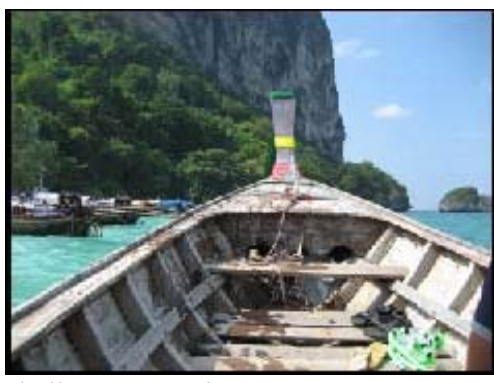
Island hopping near Langkawi