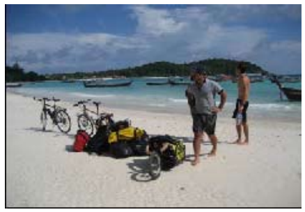
Carry all that on a bike?