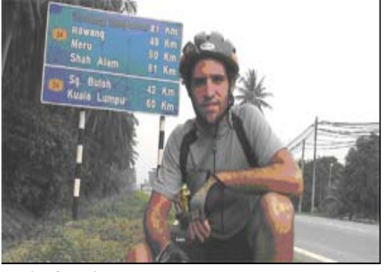
Heading for Kuala Lumpur