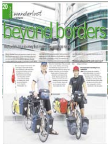
And featuring in the local news.